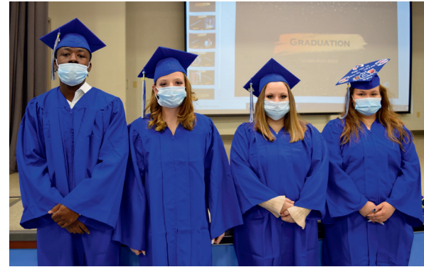
Four new graduates received diplomas during the on-grounds school trimester graduation.