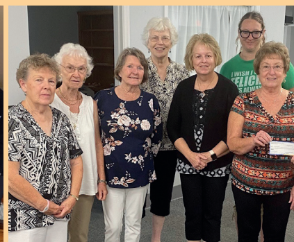
Members from Waldron UMC raised $700 for IUMCH. The church has supported the Home for more than two decades.