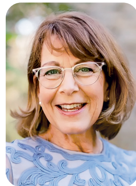
Christy Huston Foundation Executive Director