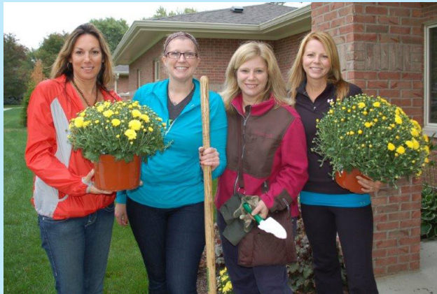
Thank you to all of our volunteers for making a difference at Indiana United Methodist Children's Home.

Organize a Donation or Gift Card Drive – Get your church VBS or group to gather needed items off of our wish list which is highlighted on the Home's website – iumch.org . Gift cards are used as incentives for positive behavior and for special occasions like birthdays or when a youth has a specific need.