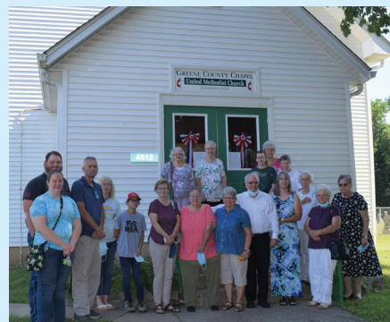
Members of Greene County Chapel are proud to be partners in ministry with the Home.

The Home is grateful to all of our United Methodist Churches from around the state. You are a true blessing to the Home!