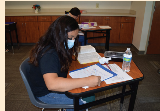
Even though classroom sizes are small at the on-grounds school, students will wear masks and practice social distancing.