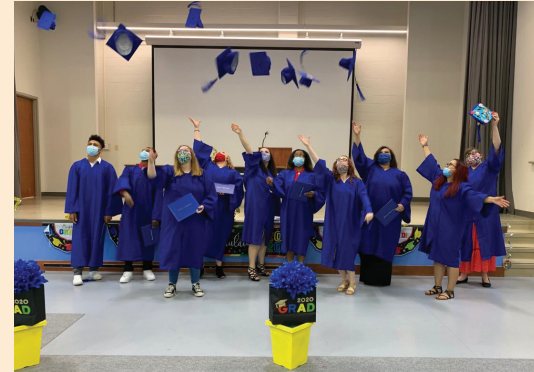
Over the past year, 20 graduates have earned their high school diplomas. Several students have enrolled in post-secondary education.

A small group toured the school recently and one of the visitors observed some of the teachers in the classroom. The visitor said, "It is evident the teachers teach from the heart and not just from the books."