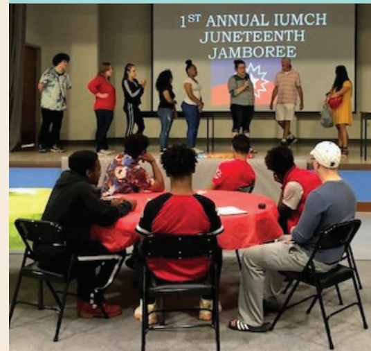
Juneteenth Celebration at Indiana United Methodist Children's Home.