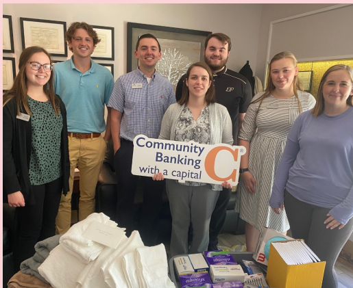
Staff from The Farmers Bank delivered a car load of toiletries and school supplies.