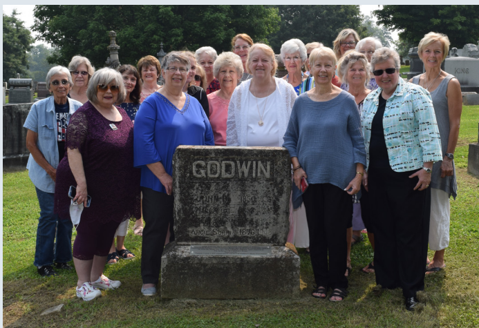
Putnam County UMW attended the dedication ceremony at Forest Hill Cemetery.