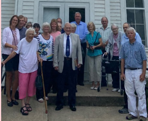
Members of Waverly UMC pose proudly in front of their historic church. They have been partners in ministry with the Home for many years.