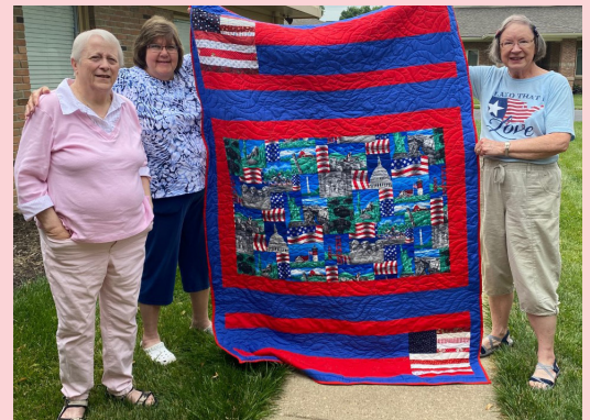
Members of Christ UMC, Indianapolis, delivered quilts to the Home, just in time for the Fourth of July. As you can see, the patriotic quilt was beautifully made.

Well done they good and faithful servants.