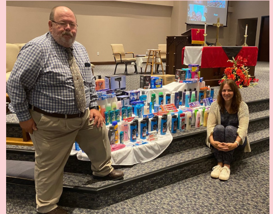
Members of the Danville UMC mission team coordinated a donation drive for the Home.