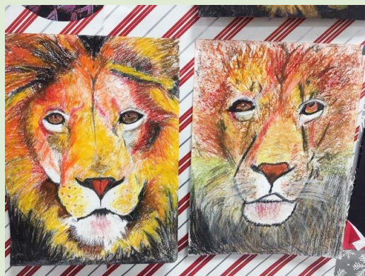
This drawing by one of the girls was inspired by her evening at Christmas at the Zoo. As she stated, "I love drawing animals and I had a chance to see so many at the zoo. I spent most of my time with the tigers since they are so beautiful."

Thanks to our friends and donors, it was truly the Best Christmas Ever!