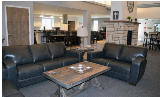
The Teaching Family Homes are welcoming and provide a safe environment for our youth.