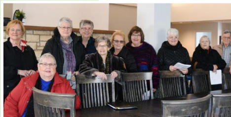
Through their membership dues, the Auxiliary provided funds for a beautiful, handmade dining room table in one of the new Teaching Family homes.

to do. Simply send a note to Indiana United Methodist Children's Home along with your gift. Please make sure to include your name, address and phone number on the correspondence. For your convenience, you may use the enclosed envelope.