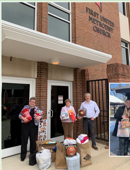
First UMC, Columbus

In upcoming issues of News@Home, more churches will be highlighted who continue to support the Home. So...stay tuned and maybe your church will be next!