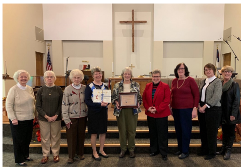
IUMCH values all Auxiliary folks from around the state. Recently, Shiloh UMC – United Methodist Women were honored for their support of the Home and Auxiliary.

Mark your calendars for Saturday, April 25th at 10:00 a.m. This is the date for the Annual Auxiliary program and open house held at Gress Chapel (615 West Essex) located on the Lebanon campus. During the program, you will hear about our successful Teaching Family Model and we will announce the Auxiliary Student of the Year. Special music will also be provided to lift your soul! Following lunch with our youth, tours will be available of the campus which includes a visit to one of our Teaching Family homes, the school and our chapel. For your planning