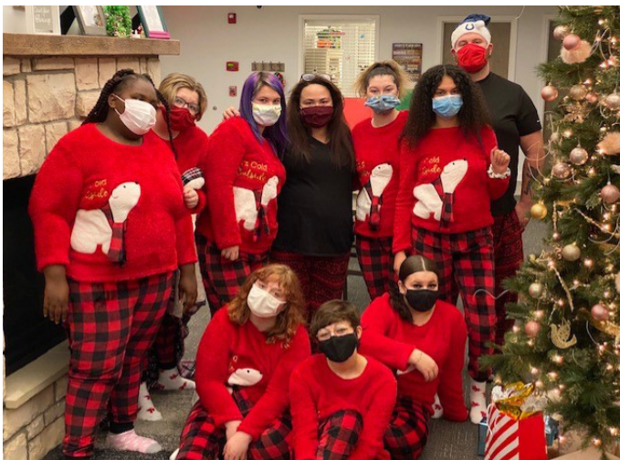
The girls in the Independent Living home wanted to get a good night's sleep before their big day at the zoo. As you can see, they all wore matching Christmas pajamas.