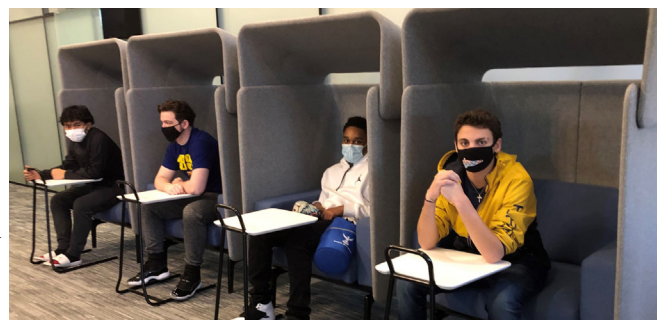
The Independent Learning Lab features study carrels for individual learning.

Through the Indiana United Methodist Children's Home Foundation's Raise the Roof – 2020 Lenten Challenge Campaign, more than $40,000 was raised to help purchase the special furnishings.