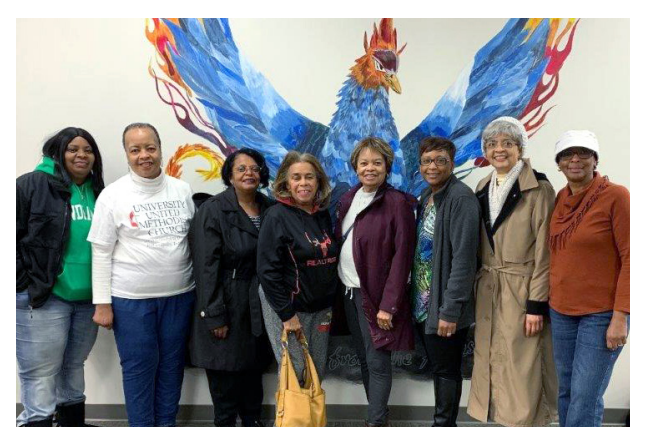
Groups from all over Indiana tour the Home. We enjoyed meeting members from University United Methodist Women (Indianapolis) last month. They also gave a generous monetary donation. Come and see us! You will always feel at HOME!