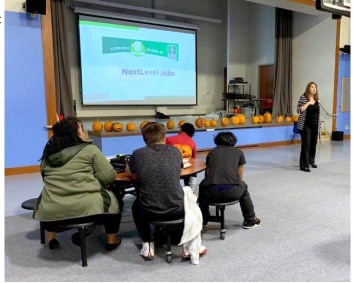
Thank you, Ivy Tech, for providing an informative program on the benefits of attending a community college.

Last month, staff from Ivy Tech-Indianapolis, provided an outstanding program on the benefits of enrolling in a community college. Not only is the tuition affordable but