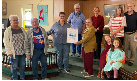
Whitestown United Methodist Church