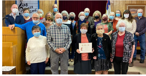
Beech Grove United Methodist Church, Greencastle