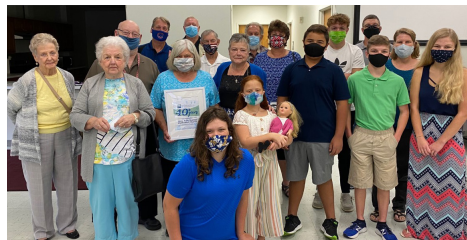
Ohio Falls United Methodist Church, Jeffersonville

If you ever take a road trip throughout Indiana and decide to take the county roads, you are guaranteed to find hundreds of United Methodist Churches along the way. Many are small but are supporting multiple missions in their own back yard and those from across the state.