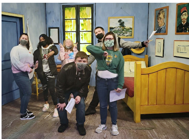
Youth at the Home visited the Indianapolis Museum of Art and are pictured in a replica of Van Gogh's studio.