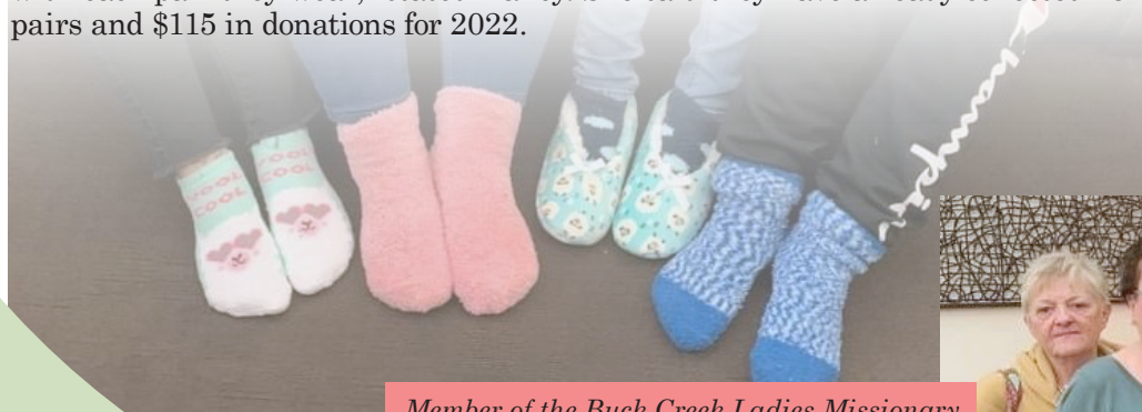
Member of the Buck Creek Ladies Missionary Society delivered socks to the girls in Wesley Home right before Christmas. The girls had hundreds of socks to choose from.