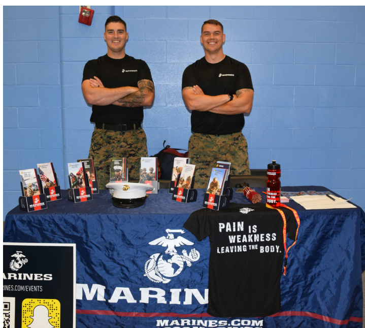
Recruiters from the United States Marines were present at the job fair and talked to many of the students about opportunities made possible through the military.