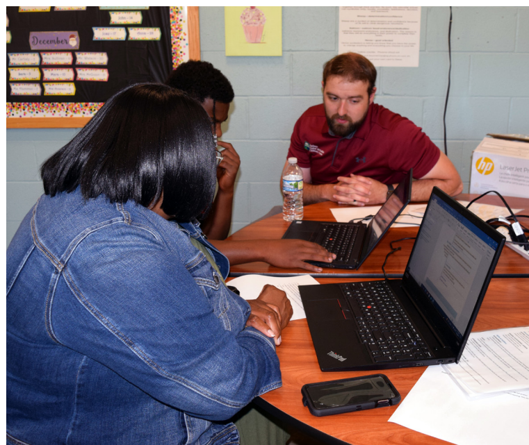
Mock interviews and preparing resumes were also a large part of the job fair. Volunteers from different careers helped the students with interviewing skills. Several youth left with completed resumes.