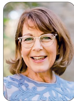
Christy Huston Foundation Executive Director

His compassion for each child was evident in his joy of leading our annual Best Christmas Ever campaigns, to help ensure the youths on our campus would feel loved and learn the spirit of the Christmas Season.