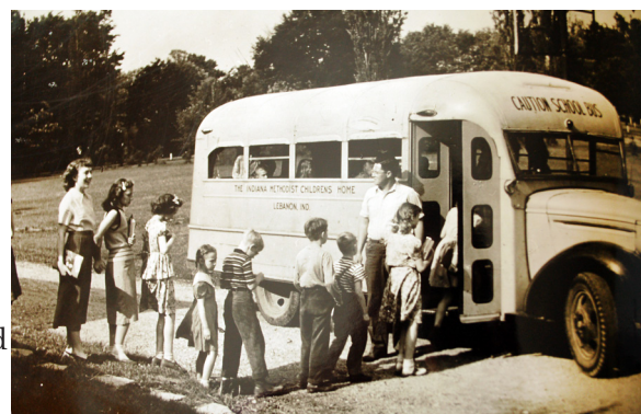
As you can see in this historical photo taken in the 1940's when the Home was an orphanage, youth were transported to classes in one of the Home's school buses. At that time, younger children attended nearby Harney Elementary. In 1972, the James E. Davis School was built on the Home's campus. In 2015, the new James E. Davis School was built.